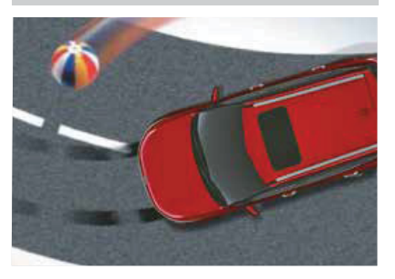
Enhanced safety features allow you to stay in complete control