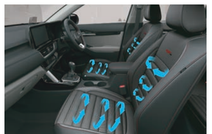
Enhance comfort and convenience, making every drive you take a memorable experience