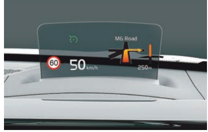
Makes driving safer by minimizing the movement of driver's line of sight