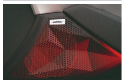
Is a treat for the ears. It will set your mood right for every drive