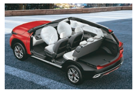
Provide superior safety making your every drive safe and worry-free