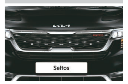
Lends aggressive attitude to the front