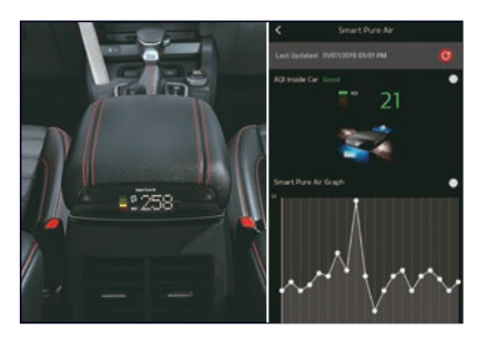
Fights against virus and bacteria while monitoring AQI status