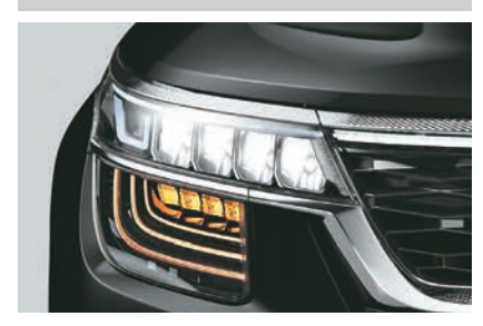
Provide a distinctive bold character and better visibility in the dark