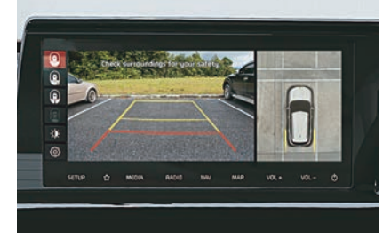
Keeps you aware of surroundings at all times