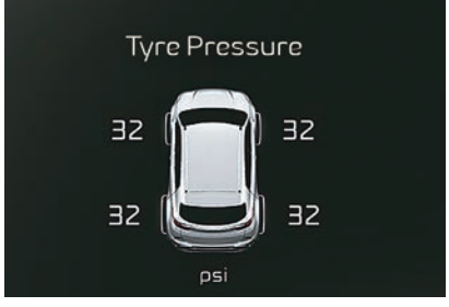
Displays real-time tyre pressure information and alerts if the pressure falls below the recommended levels