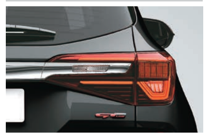
Complement the muscular back to give it a premium appearance