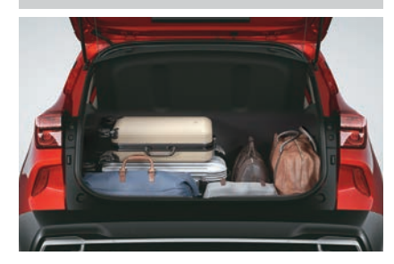
Allows easy access and spacious enough to accommodate luggage for a weekend trip