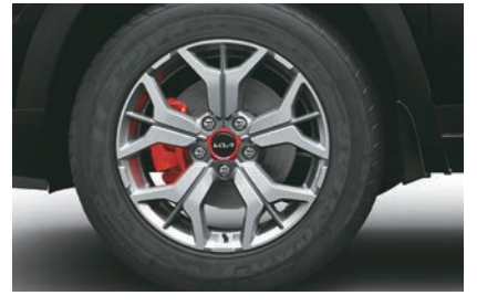
Are absolute showstoppers. One glance, and you'll know why