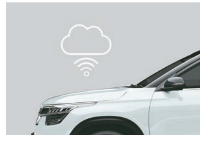
Offer latest Map updates conveniently via Over-the-air Technology