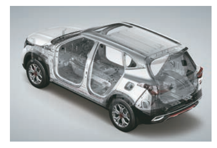
Provides enhanced safety and rugged strength to your Kia Seltos