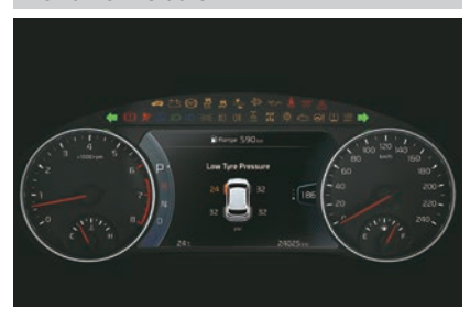
Displays information which is very easy to read in all light conditions that enhances your overall cabin experience