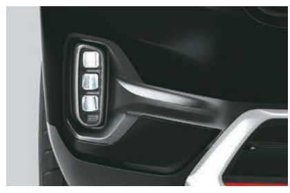
Enhance its overall sporty appeal