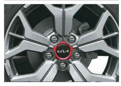
Let you stay in control in case of accidental braking