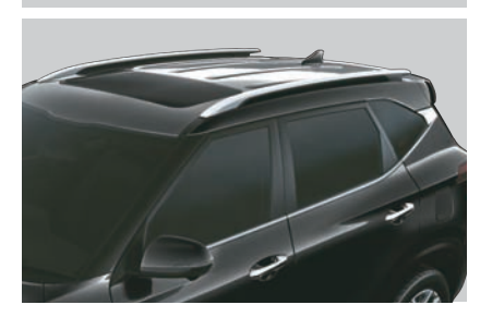
Lets you stay connected to the outside world