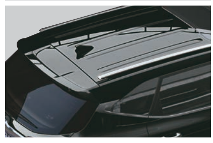
Give a sporty and dynamic appeal to the badass design