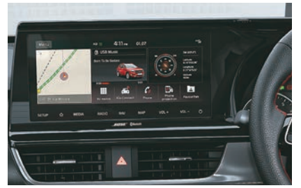
Makes the cabin look plush and futuristic that keeps you stay connected to find your way effortlessly