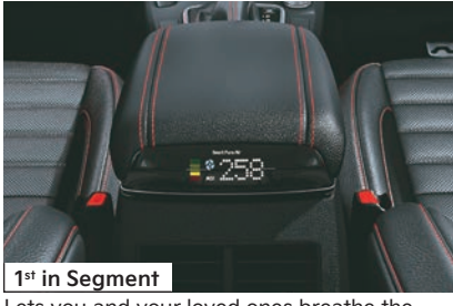
Lets you and your loved ones breathe the cleanest air inside the car