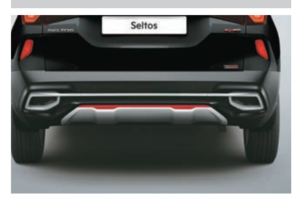
Adds to the tough looks and provides a strong road presence